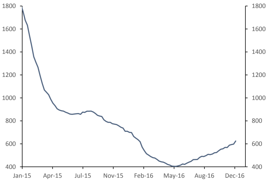
Chart 4: US Oil and Gas Rig Count