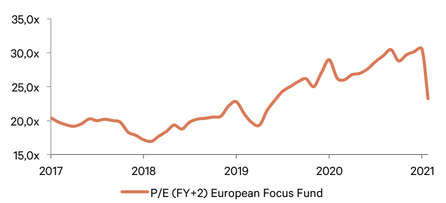
Fig. 1: Portfolio valuation data European Focus Fund (P/E FY+2): back to pre COVID levels

Strikingly, the valuations of our portfolios are also back at pre-COVID levels. This gives us confidence, that going forward the valuation headwind we faced should slow down, allowing the continued strong earnings growth of our companies to drive future performance. Our portfolios have been adding strong alpha since inception but also since March 2020, when the COVID-19 crisis began, despite the valuation compression and performance losses recently, as our holdings had a far better earnings trajectory.